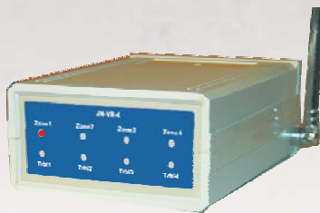
JNVR-4 Four Zone Receiver