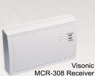
Visonic MCR-308 Receiver